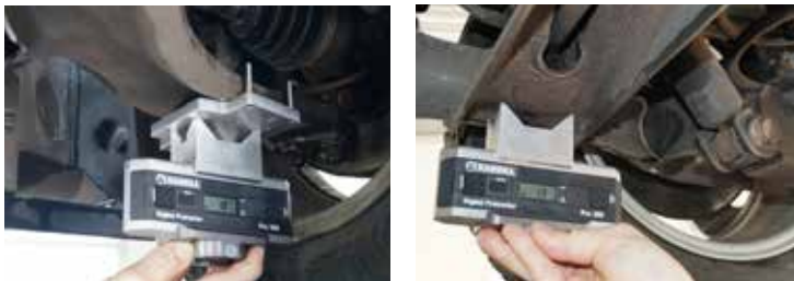
Application examples (measuring adapter ③ and crown adapter ①)